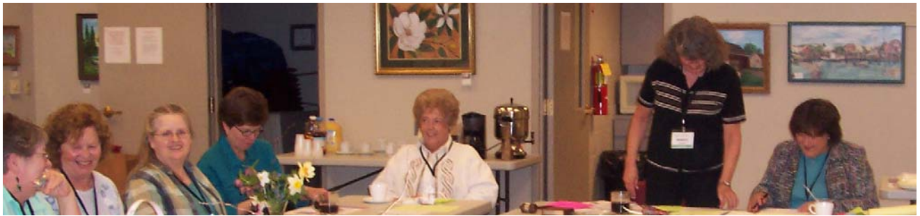
Lots of good ideas came from the "Brainstorming" Meeting May 1 st .