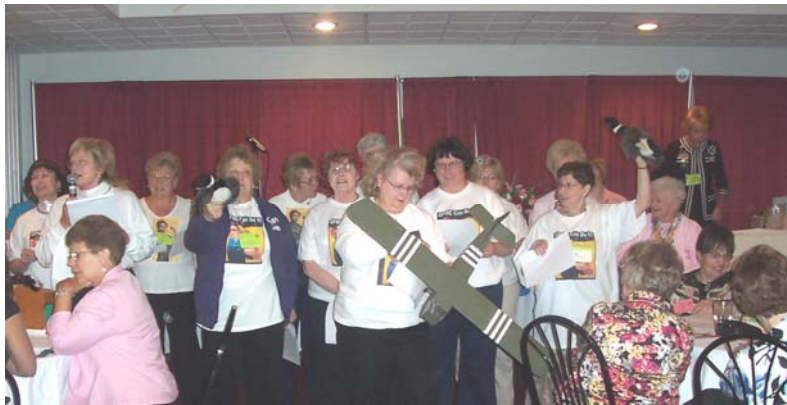
The UP invites us to Iron Mountain next May 14 – 16 for the GFWC MI Convention